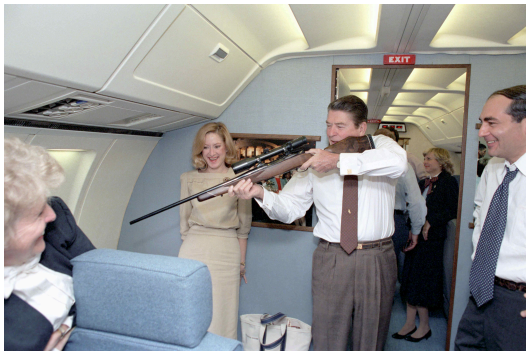
President Ronald Reagan aiming a rifle while flying aboard Air Force One in 1983.

For downloadable images, visit pbs.org/pressroom/